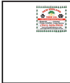
ONE-SIXTH PAGE 3.5 wide by 3.0 high