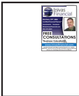
QUARTER PAGE 3.5 wide by 4.75 high