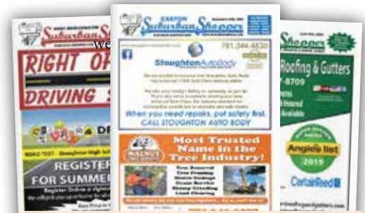
Weekly and Monthly Print Editions