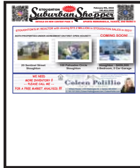
FRONT OR BACK COVER HALF 7.5 wide by 4.3 high

COLOR $439 / BW $414 COLOR $259 / BW $239