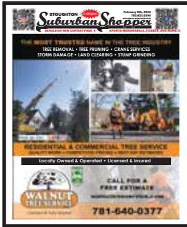
FRONT OR BACK COVER FULL 7.5 wide by 8.7 high