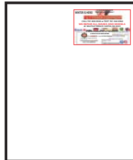
ONE-EIGHTH PAGE 3.5 wide by 2.3 high