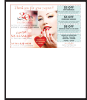
HALF PAGE INSIDE 7.5 wide by 4.625 high