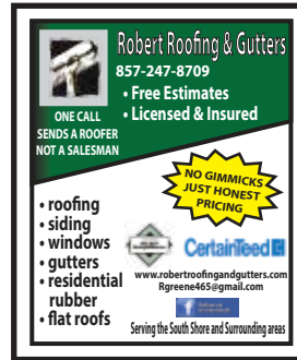
FULL PAGE INSIDE 7.5 wide by 9.75 high

COLOR $439 / BW $414 COLOR $259 / BW $239