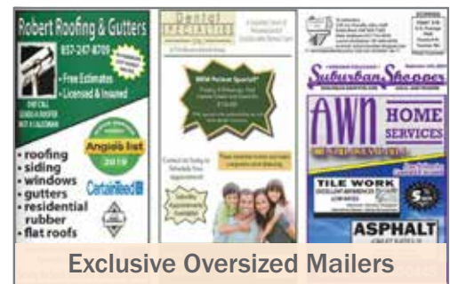
Exclusive Oversized Mailers