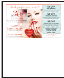
HALF PAGE INSIDE 7.5 wide by 4.625 high