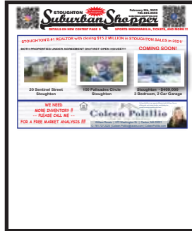
FRONT / BACK COVER HALF 7.5 wide by 4.3 high