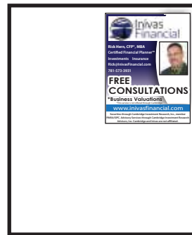
QUARTER PAGE 3.5 wide by 4.75 high

QTR PAGE IS THE SMALLEST SIZE FOR THE 2500 ADDRESSES TOWNS