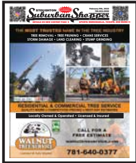
FRONT / BACK COVER FULL 7.5 wide by 8.7 high