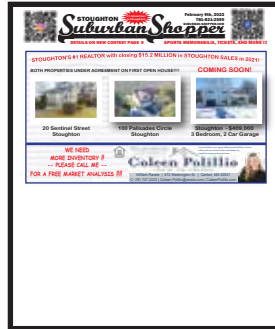
FRONT OR BACK COVER HALF 7.5 wide by 4.3 high

COLOR $439 / BW $414 COLOR $259 / BW $239