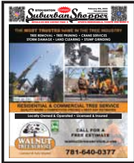
FRONT OR BACK COVER FULL 7.5 wide by 8.7 high