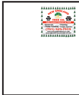
ONE-SIXTH PAGE 3.5 wide by 3.0 high