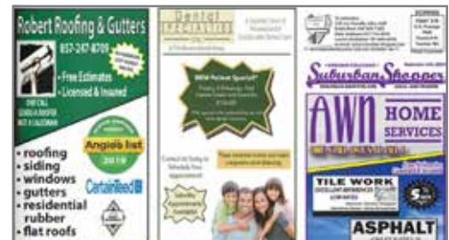
Exclusive Oversized Mailers