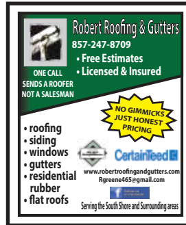
FULL PAGE INSIDE 7.5 wide by 9.75 high

COLOR $439 / BW $414 COLOR $259 / BW $239