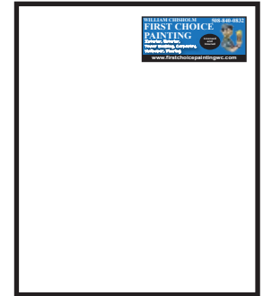
ONE-SIXTEENTH PAGE 3.5 wide by 1.5 high

CLASSIFIEDS $35 - BOX AD CLASSIFIEDS $45