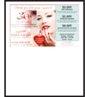
HALF PAGE INSIDE 7.5 wide by 4.625 high