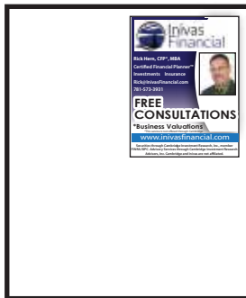
QUARTER PAGE 3.5 wide by 4.75 high