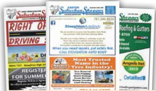
Weekly and Monthly Print Editions