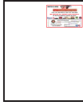
ONE-EIGHTH PAGE 3.5 wide by 2.3 high