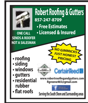
FULL PAGE INSIDE 7.5 wide by 9.75 high