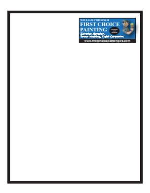
ONE-SIXTEENTH PAGE 3.75 wide by 1.8 high