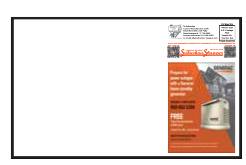
COVER AD (Below Indecia) 4.25 wide by 5.5 high