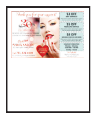
HALF PAGE INSIDE 7.5 wide by 4.6 high