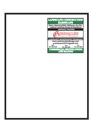
ONE-SIXTH PAGE 3.5 wide by 3.0 high