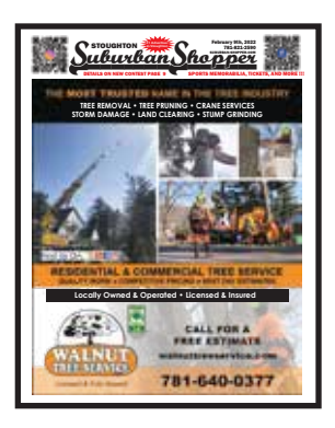
FRONT OR BACK COVER FULL 7.5 wide by 8.7 high