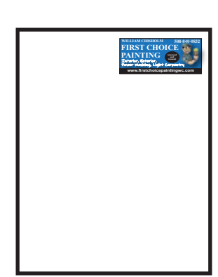
ONE-EIGHTH PAGE ONE-SIXTEENTH PAGE 3.5 wide by 1.5 high