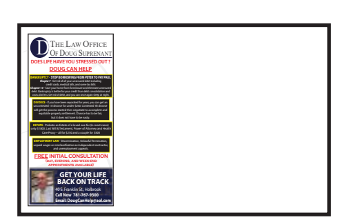
LARGE AD (3rd Page) 4.25 wide by 8.0 high