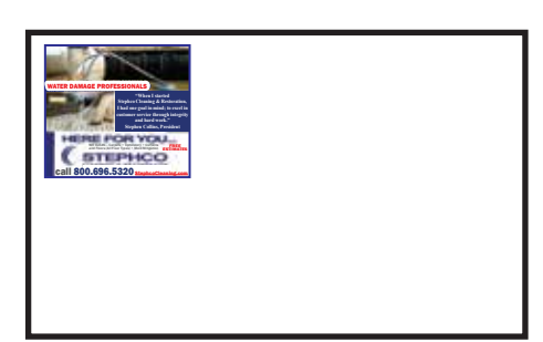
SMALL AD (6th Page) 4.25 wide by 3.875high