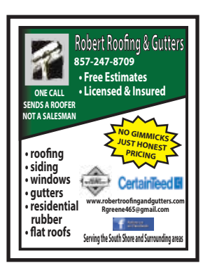
FULL PAGE INSIDE 7.75 wide by 10.0 high