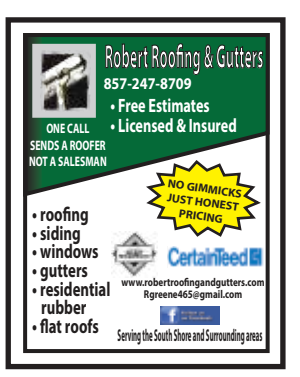
FULL PAGE INSIDE 7.5 wide by 9.625 high