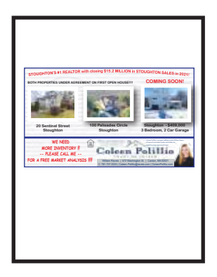
FRONT OR BACK PAGE HALF 7.75 wide by 4.0 high