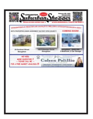
FRONT OR BACK PAGE HALF 7.5 wide by 4.3 high