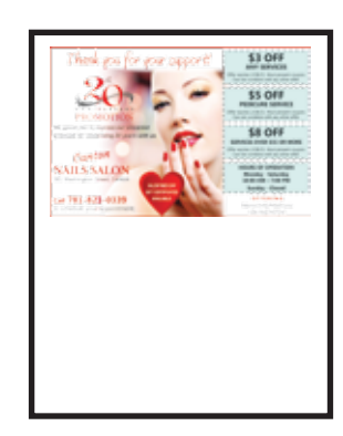
HALF PAGE INSIDE 7.75 wide by 4.875 high