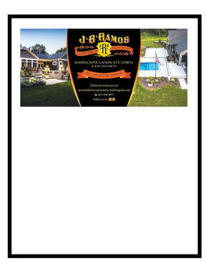
1/3rd PAGE HORIZONTAL - $275 8 wide by 3.25 high