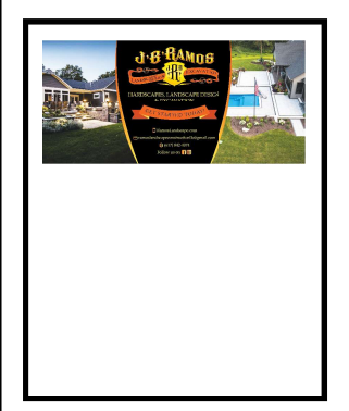
ONE - THIRD PAGE 7.5 wide by 3.0 high