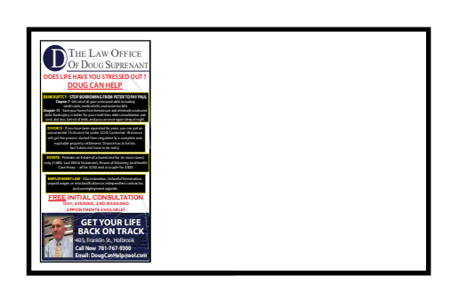
LARGE AD (3rd Page) 4.25 wide by 8.0 high