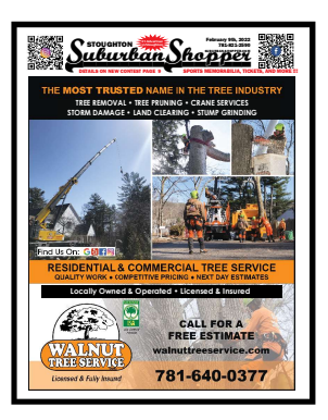
FRONT OR BACK COVER FULL 7.5 wide by 8.8 high