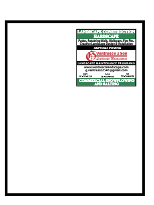
ONE-SIXTH PAGE 3.5 wide by 3.0 high