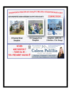
2/3rds PAGE - $499 8 wide by 6.75 high