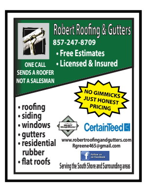
FULL PAGE INSIDE 7.5 wide by 9.75 high