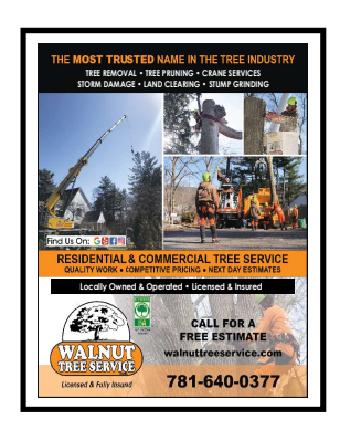
FULL PAGE - $649 8 wide by 10.25 high