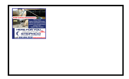
SMALL AD (6th Page) 4.25 wide by 3.875high