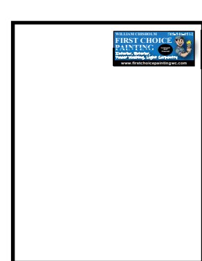
ONE-SIXTEENTH PAGE 3.5 wide by 1.5 high