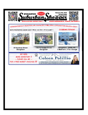
FRONT OR BACK PAGE HALF 7.5 wide by 4.4 high