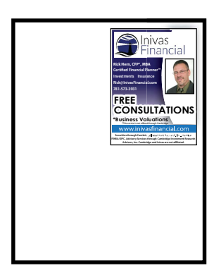
QUARTER PAGE - $199 3.75 wide by 4.875 high