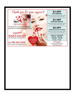
HALF PAGE - $349 8 wide by 5.25 high