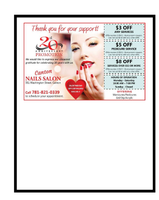
HALF PAGE INSIDE 7.5 wide by 4.75 high