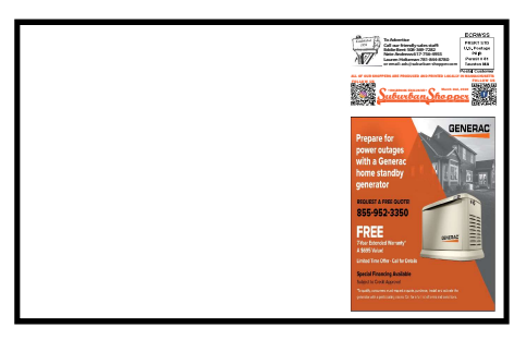
COVER AD (Below Indecia) 4.25 wide by 5.5 high